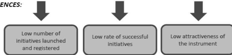
Figure 1. Framework of the reform